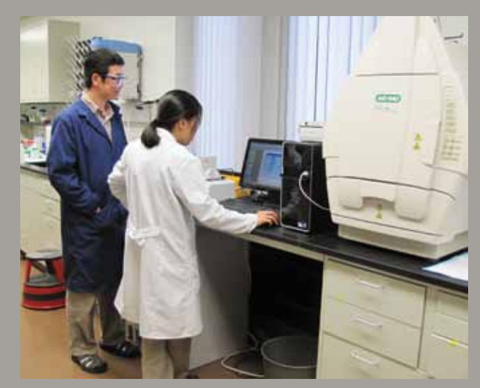
Renovated Research Lab

Similarly, we will be renovating labs and stockroom space in our north wing of the 2nd floor which is adjacent to the new 109 labs. These new labs will be designed and built with similar specification to the 109 labs.