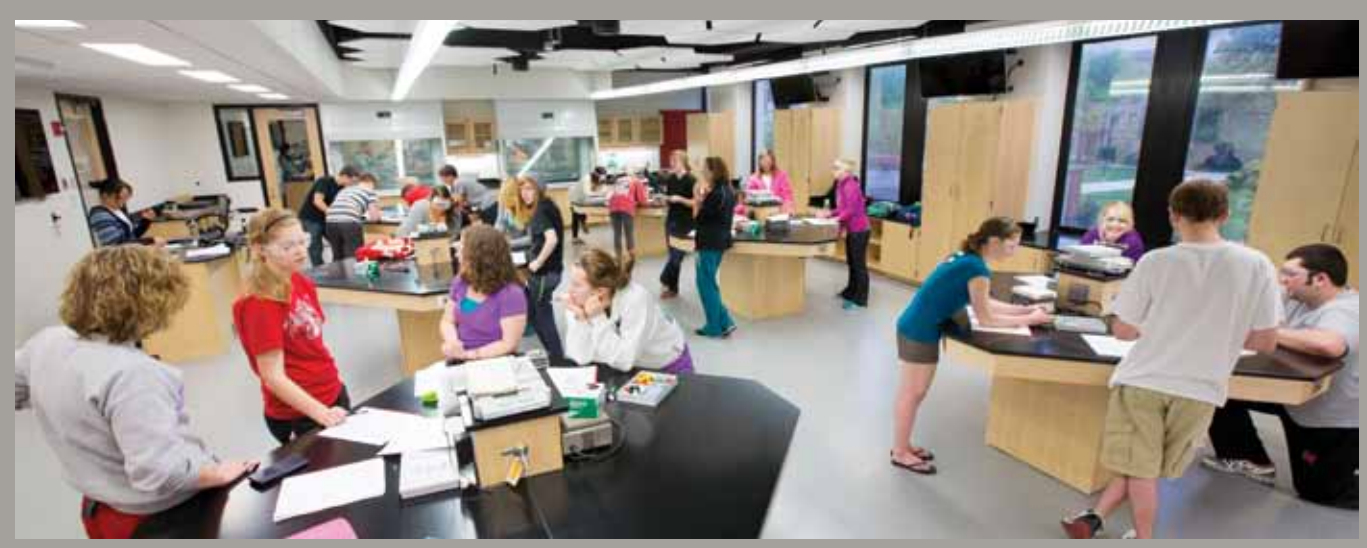
Renovated Undergraduate Lab