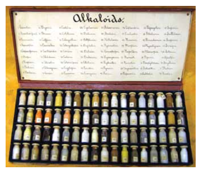
72 alkaloids in their case.

The full list of alkaloids is published on our departmental Web page (http://www.chem.unl.edu/alumni/) so you can do your own research, but please let me know what you find. I'd also welcome other hypotheses. If you do have any information on this case of 72 alkaloids, please email me at <a href="majriep1@unl.edu">mgriep1@unl.edu</a>. I look forward to hearing from you!