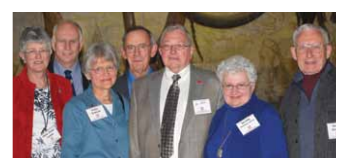
A group of reunion attendees stop to pose for a photo at the 2011 Chemistry Reunion Alumni Banquet.