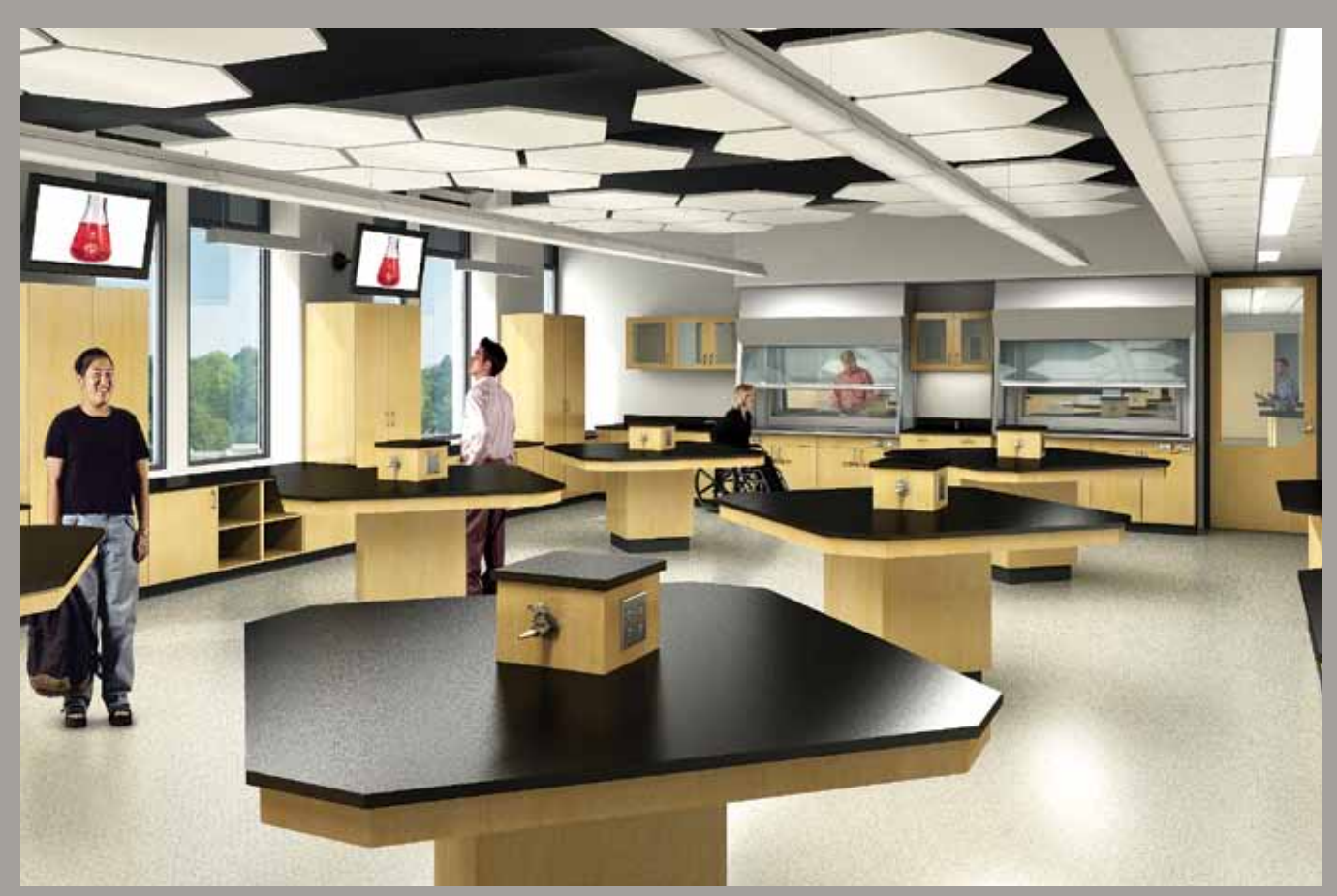
A rendering done by HDR, the architect for the undergrad lab renovation, shows what the completed labs will look like.